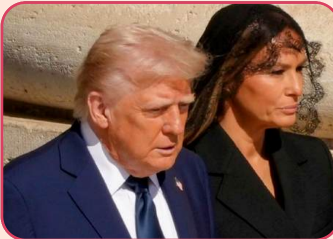
President Trump and his wife, Melania at Pope Francis' Funeral. bit.ly/trump-pope-funeral

and said to everyone: "God loves you!" He personally visited God's people in the most remote corners of Africa and Asia emphasizing that loving and worshipping Jesus means adopting a "preferential option for the poor," which became central to the Church since the Vatican II Council (1962). Pope Francis, in his encyclical Evangelii Nuntiandi (11/24,13) already pointed out what has been dominating Trump's administration in 2025: