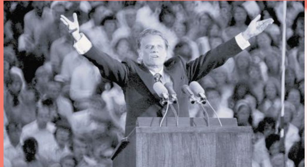
The spread of Evangelicalism was enhanced by the weekly newspaper "Sermons" and the autobiography (Just As I Am) of Billy Graham who preached that "faith is all that is needed for salvation."

tied to a specific Christian denomination, but were followers of the 18<sup>th</sup> century's socio-political philosophy of the Enlightenment. That's why most of the contents of the American Constitution carry Christian values. Benjamin Franklin even declared that the love of God requires that we fully love our neighbor.