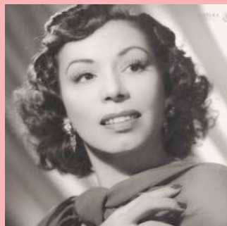
Eva Garza Pioneer of Mexicana women on stage and theater