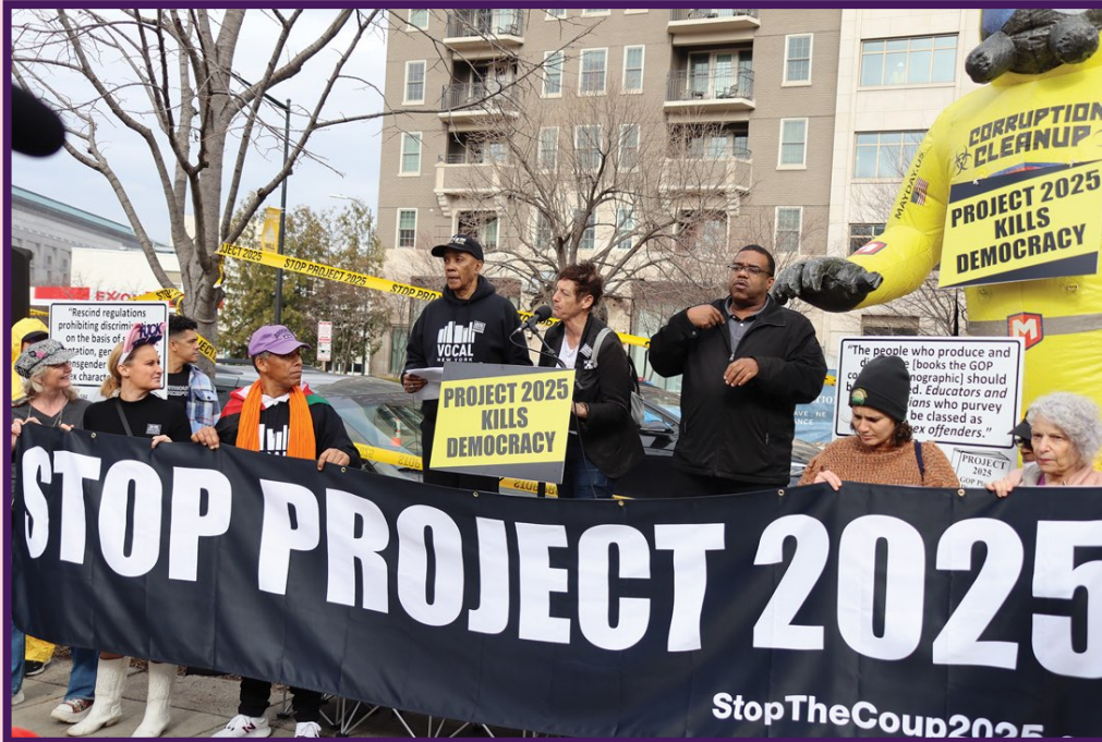
STOP PROJECT 2025 Rally across from Heritage Foundation at Triangle Park along Massachusetts Avenue between 2nd and D Street, NE, Washington DC on Saturday afternoon, 27 January 2024