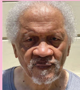
Non-Fiction Ishmael Reed (virtual instruction)