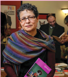
Fiction Helena María Viramontes