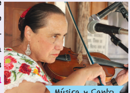
Música y Canto