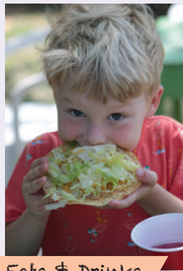
Eats & Drinks

and soul; those times when self-care practices included limpias, sobadas and remojadas; those times that took the whole person into account when curanderas did their thing to cure gente. Walk the streets of the Westside and see the historic homes, photo-historias and cultural sites while listening