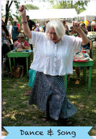
Dance & Song

The Esperanza's annual celebration of all things Westside in San Antonio takes place Saturday, May 6, 2023 . Join us from 9am to 3pm at the Rinconcito de Esperanza, 816 S. Colorado to experience Aquellos Tiempos: those times in the Westside of San Antonio when tienditas thrived in every neighborhood; those times when plantas medicinales in our own yards were used as remedies for all sorts of ailments of both, body