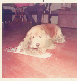
Topper, Dudley's beloved dog