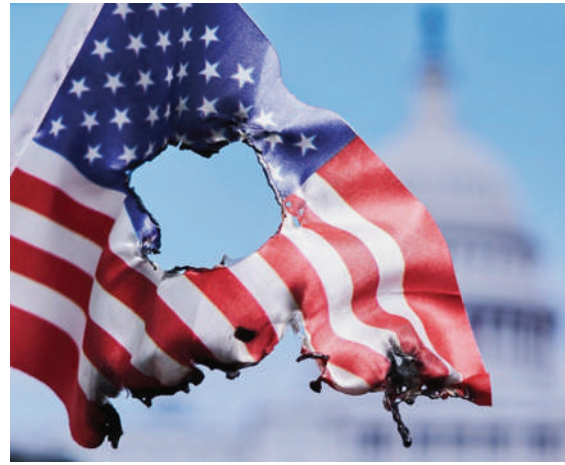
Havoc wreaked at the U.S. Capitol Building on January 6, 2021 included: burned and stomped American flags, shattered windows, and vicious attacks on police officers.

The worship of violence has become quite widespread during this last decade, setting up a climate for evil, and terroristic acts that are facilitated by the lack of control of deadly weapons under the excuse that their possession is a legitimate constitutional right. Thus freedom is turned into a supreme value, making human life expendable. Hence the recently-voiced, ridiculous solution that we can deal with a person armed with a bad gun by having another person holding a good gun; or by militarizing our schools, hospitals, churches, synagogues, restaurants, marketplaces, etc. The majority of the Republican congressmen and governors, instead of emphasizing the sacredness of human life, exhibit a strong devotion for guns and a blind, ahistorical interpretation of the Second Amendment, as shown by the Republican congres-