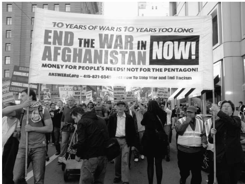
The end of the 20-year-long Afghanistan War in 2021 has left many questions unanswered that were pointed out in protests throughout the U.S. involvement in Afghanistan.

All the above data plus much more clearly point to the fact that those who govern serve not only the MIC and corporate interests but also wealthy investors who expect their stock holdings to benefit from such tragedies. For example, only the wealthy investors in the giant manufacturers benefitted tremendously from the past 20 years of war. According to a CNBC business report, General