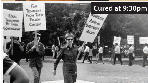
Cured at 9:30pm