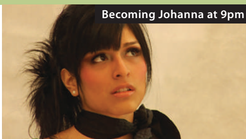
Becoming Johanna at 9pm