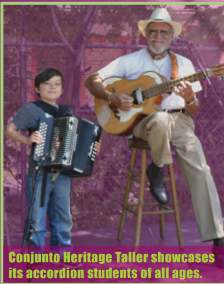
Conjunto Heritage Taller showcases its accordion students of all ages.