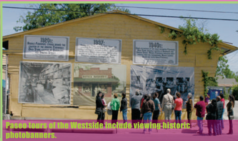
Paseo tours of the Westside include viewing historic photobanners.