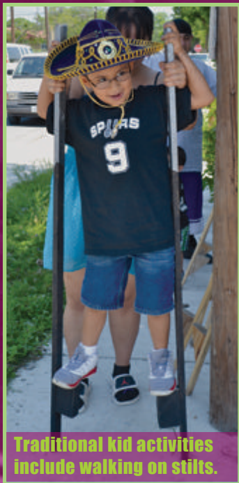
Traditional kid activities include walking on stilts.