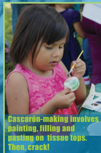
Cascarón-making involves painting, filling and pasting on tissue tops. Then, crack!