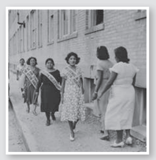
August 11, 1933. Mujeres picket Finck Cigar Factory, 602 Buena Vista St., pleading for better working conditions

One hundred years ago, on June 4, 1919, Congress passed the 19th Amendment, prohibiting the states and the federal government from denying the right to vote to citizens of the U.S. on the basis of sex. It was ratified on August 18, 1920 and became law on August 26, 1920. However, voting rights continued to be denied to people on the basis of racial and ethnic origin for years to come, making this a bittersweet victory for the many women of color who fought for women's suffrage.