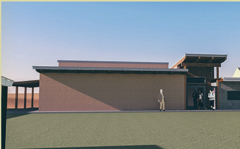
View of the proposed new compressed earth block addition at the rear of the Museo.