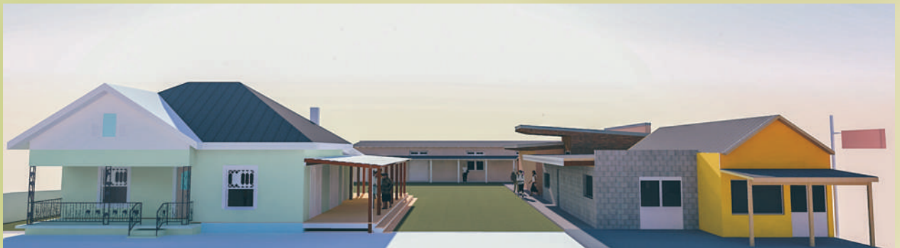
Street view of the Rinconcito de Esperanza that includes the Casa de Cuentos at left, the MujerArtes studio at the rear and the proposed new addition to Ruben's Ice House that would be the Museo at right.