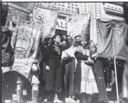
Emma Tenayuca leads the Worker’s Alliance of America rally at San Antonio’s City Hall in 1937.

A hundred years ago, on June 4, 1919, Congress passed the 19th Amendment, prohibiting the states and the federal government from denying the right to vote to citizens of the U.S. on the basis of sex. It was ratified on August 18, 1920 and became official law on August 26, 1920. Voting rights continued to be denied on the basis of racial and ethnic origin for years, making this a bitersweet victory for the women of color who fought for women’s suffrage.