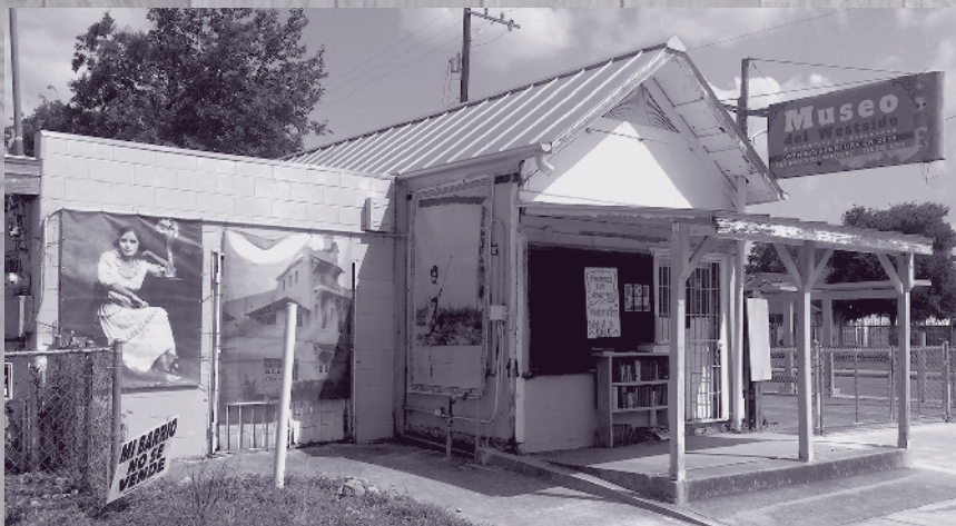
The plan is to preserve as much of the original Ruben's building as possible, and incorporate a new addition to the rear of the existing structure.

This was followed by the unveiling of the preliminary rehabilitation design plan. Dwayne and Arturo walked us through their design drawings. The plan is to preserve as much of the original Ruben's building as possible, and incorporate a new addition to the rear of the existing structure – potentially to be made from compressed earth block to match the MujerArtes studio - to allow for more gallery space and collections storage. After the presentation, we exited Casa de Cuentos so that Dwayne and Arturo could show us how the existing concrete pad behind Ruben's could be reused and then we went inside Ruben's to see how what is already there will be rehabilitated.