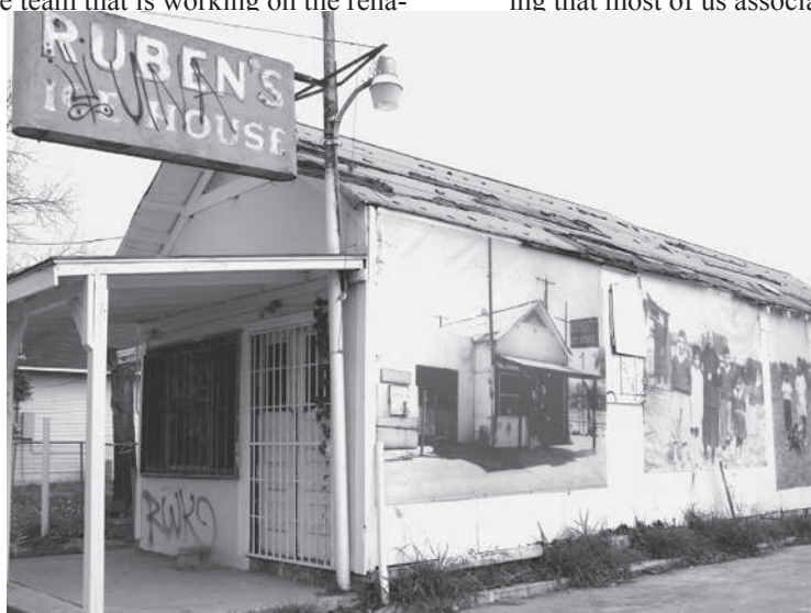
Ruben's Ice House was acquired in 2001 and is being renovated as the site for the Museo del Westside .