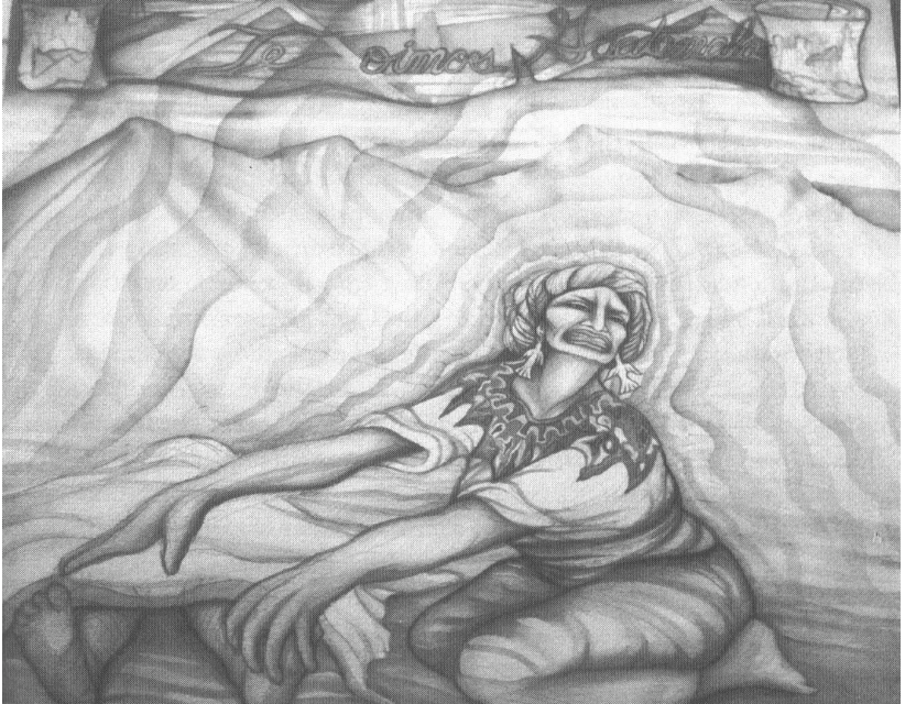
Figure 4 Juana Alicia, "Te Oímos Guatemala/We Hear You, Guatemala." 1985. A preparatory drawing for the mural in Balmy Alley, San Francisco, CA. Courtesy of the artist. The sketch also appears in Guiselle Latorre's Walls of Empowerment: Chicana/o Indigenist Murals of California (2008). The artist does not specify the medium of sketch.

deceased, with the roof-tops of the Mission in the background, and a ribbon floating above them with the words, "Te Oímos Guatemala/ We Hear You Guatemala." (juanaalicia.com)