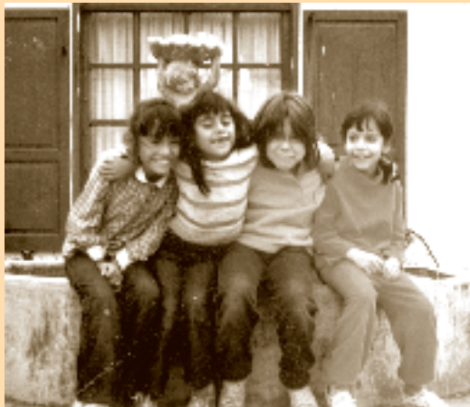
Girls from J.T. Brackenridge take a break from painting.