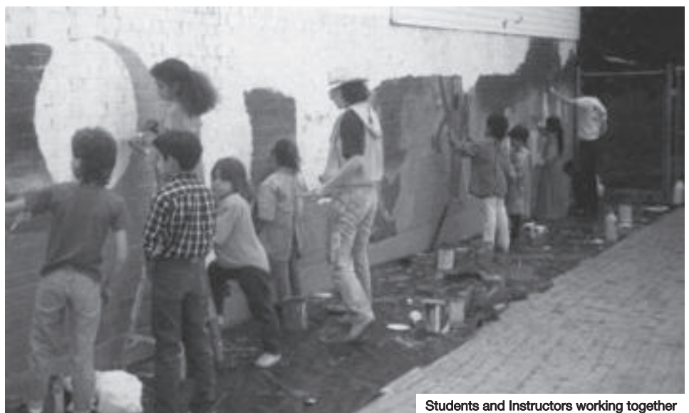
Students and Instructors working together