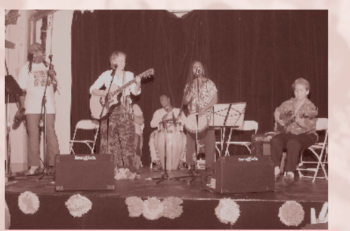
1994 & 1997 Azucar y Crema, all woman band from San Francisco, CA

collaborations with Jump-Start Theater. This allowed Mujercanto to thrive during a time of transition for the Esperanza. It returned to the Esperanza when the new space on San Pedro Ave. opened its 2nd floor in 1997. The move became necessary because Esperanza was targeted by right wing Christian zealots for our LGBT programming that led toan ouster from our N. Flores home. It also led to the withdrawal of alloted arts funding by the City of San Antonio on September 11, 1997. Mujercanto