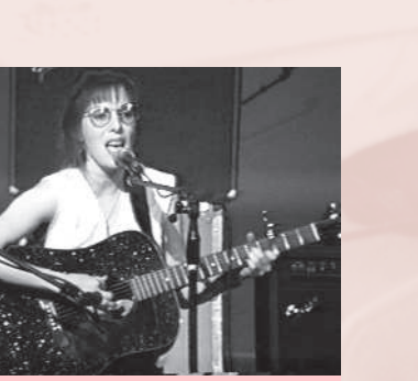
1993 Inez Newton, singer