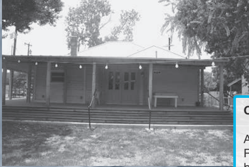
Casa de Cuentos (porch, rear view), 816 S. Colorado St.