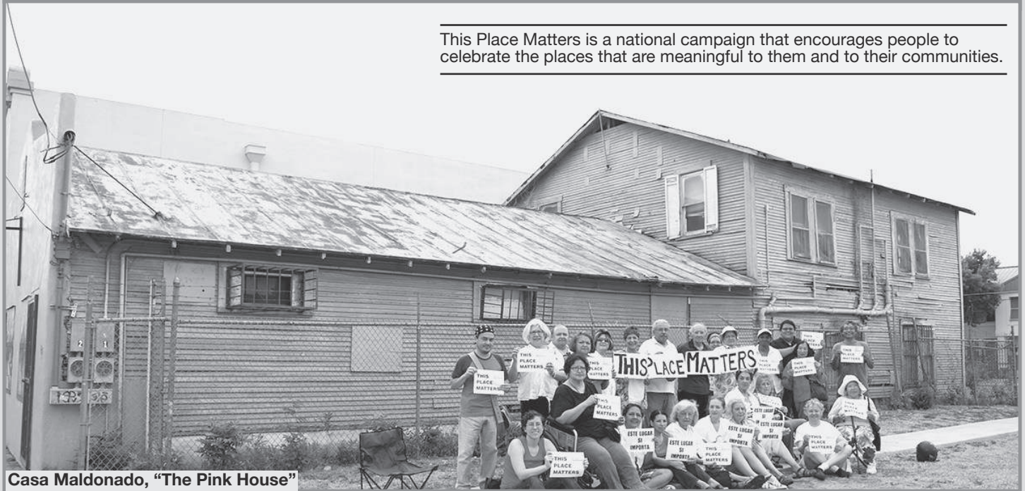
Casa Maldonado, “The Pink House”

This Place Matters is a national campaign that encourages people to celebrate the places that are meaningful to them and to their communities.