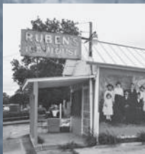
Ruben's Ice House, 820 S. Colorado St.