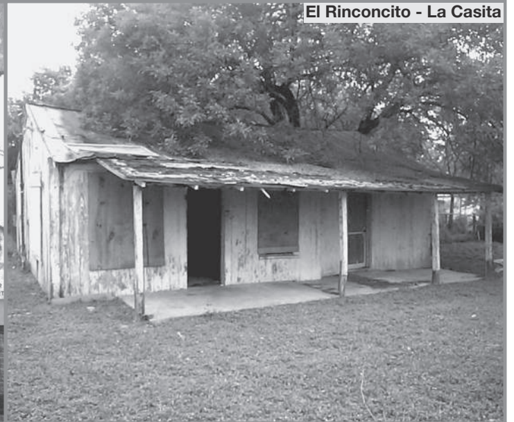
El Rinconcito - La Casita