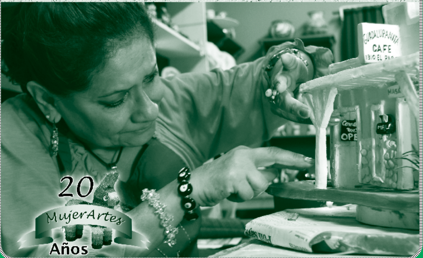
exhibit opens Sat., Sept. 12, 2015 • 6 pm at Esperanza Center