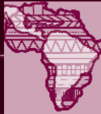
Africa Latina Aug 15